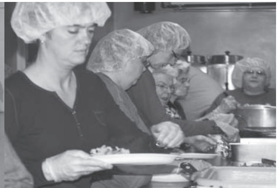
Thanks to all of the volunteers for the great job they did!