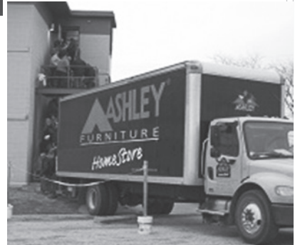
A truckful of donated food arrives