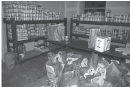
Filling up the 3rd floor pantry