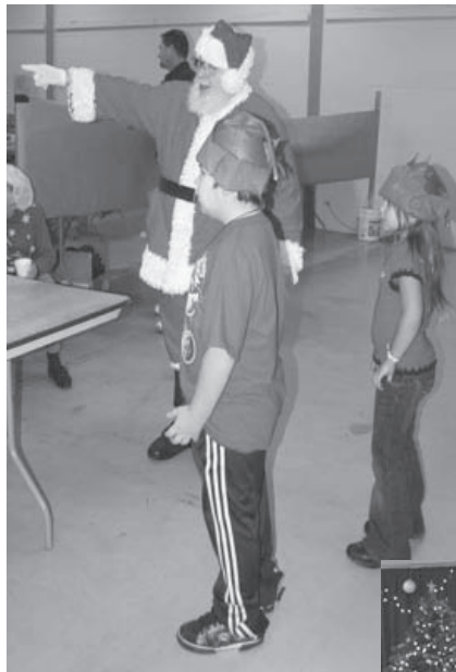
Santa Instructs His Elves

"Offering the Promise of a bright future."