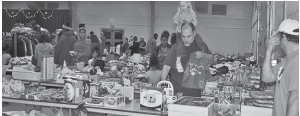
Guests "shop" the Country Store for that perfect Christmas present.