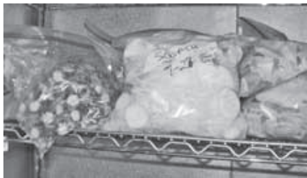
Our freezer holds some of the okra and squash that will be used at a later date.

The most impressive part of the project is the work that the men have given to weeding and care of the garden. They are proud of