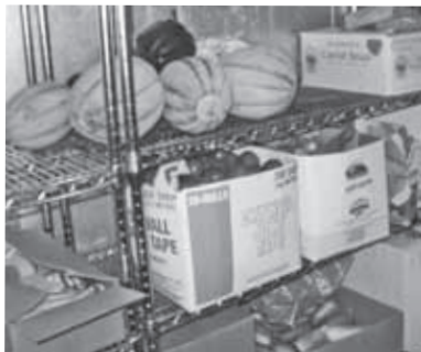
Produce from the garden is kept fresh in the mission cooler.