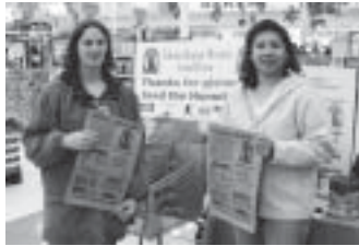
Volunteers at the Superstore