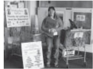
Volunteer at Southgate